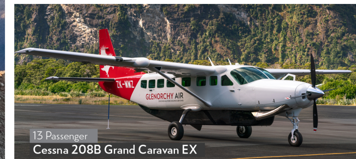
13 Passenger Cessna 208B Grand Caravan EX

We have been operating in this region for 30 years and are a Civil Aviation Authority (CAA) certificated operator.