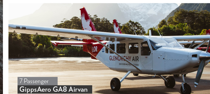
7 Passenger GippsAero GA8 Airvan