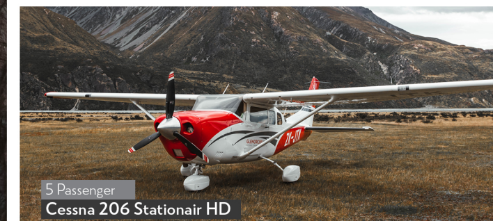
5 Passenger Cessna 206 Stationair HD