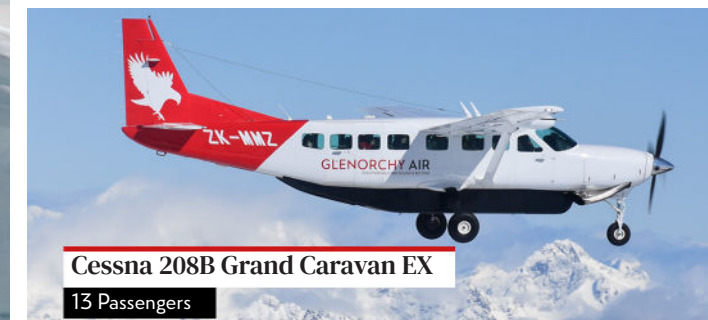
Cessna 208B Grand Caravan EX 13 Passengers

The aircraft in our fleet are available for Private Scenic Charter flights upon request.