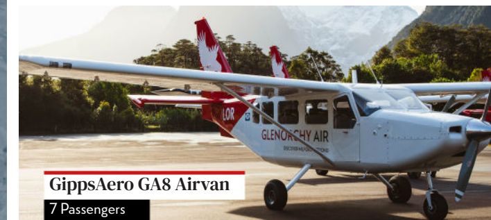
GippsAero GA8 Airvan 7 Passengers