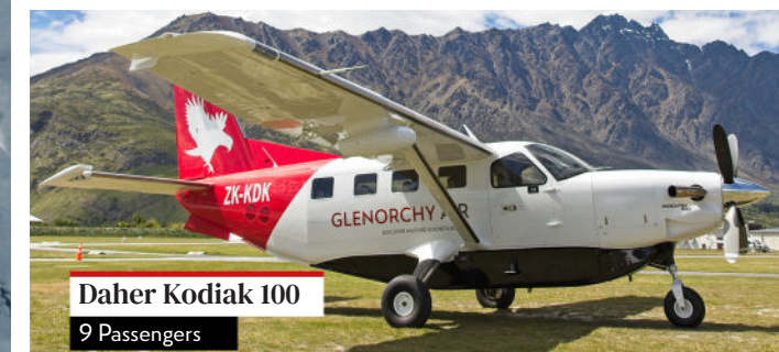
Daher Kodiak 100 9 Passengers