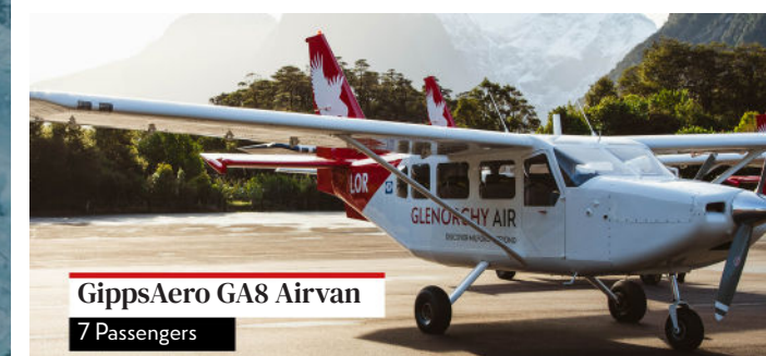
GippsAero GA8 Airvan 7 Passengers