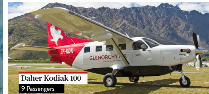
Daher Kodiak 100 9 Passengers