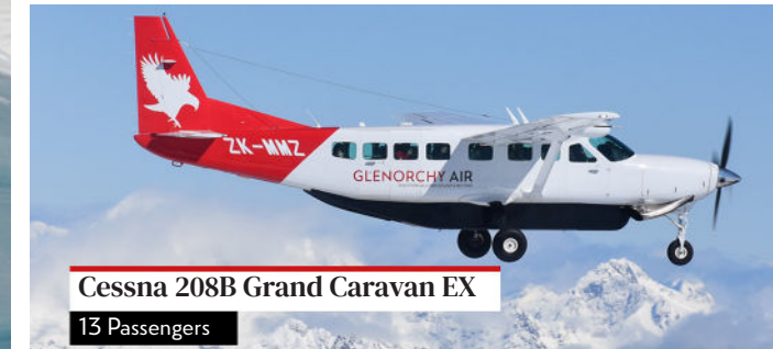
Cessna 208B Grand Caravan EX 13 Passengers

The aircraft in our fleet are available for Private Scenic Charter flights upon request.