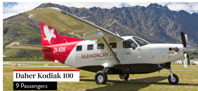
Daher Kodiak 100 9 Passengers