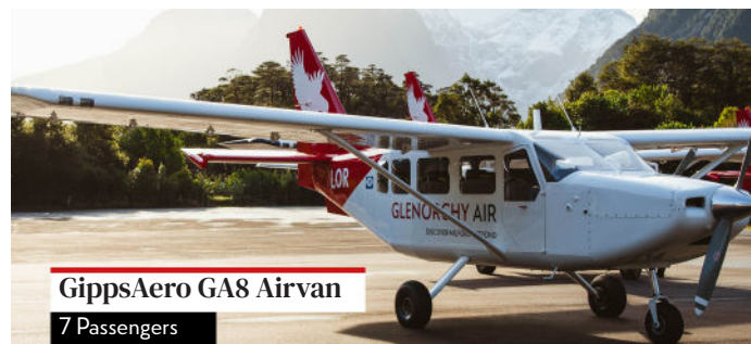
GippsAero GA8 Airvan 7 Passengers