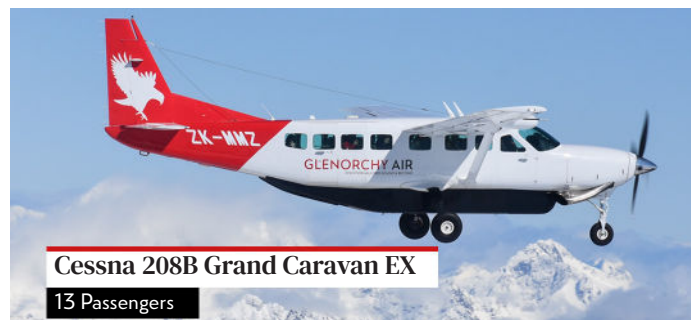
Cessna 208B Grand Caravan EX 13 Passengers

The aircraft in our fleet are available for Private Scenic Charter flights upon request.